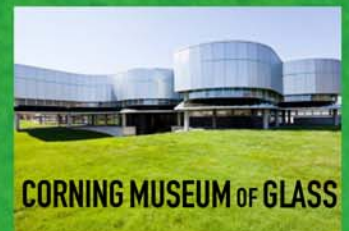
CORNING MUSEUM OF GLASS